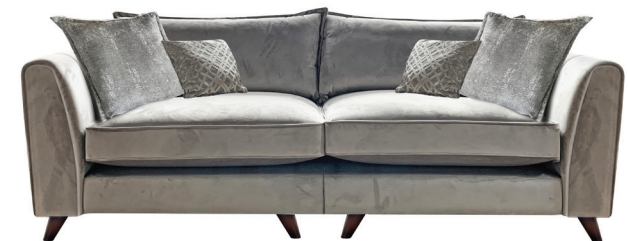
4 Seater Split Sofa