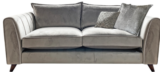
3 Seater Sofa