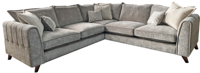
3 corner 3