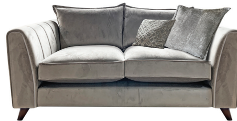
2 Seater Sofa